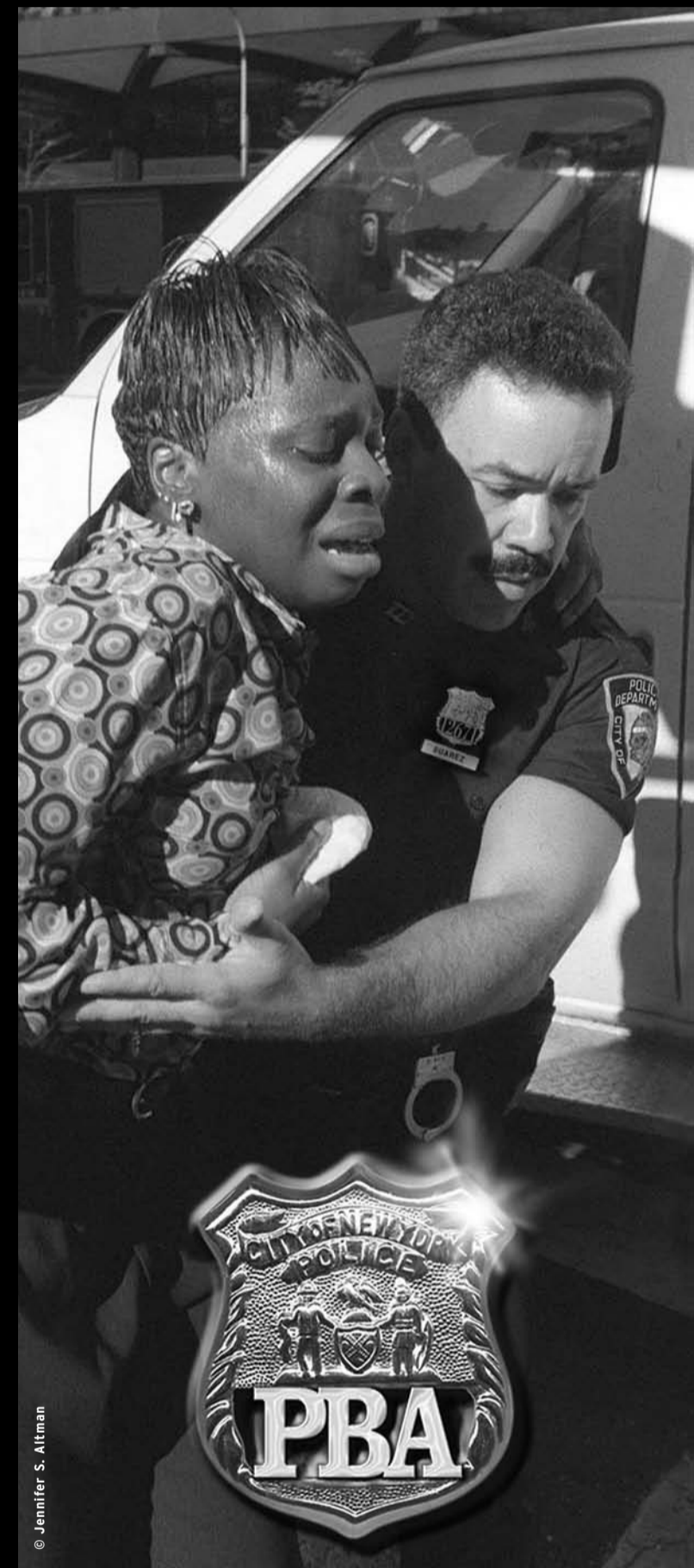
PATROLMEN'S BENEVOLENT ASSOCIATION OF THE CITY OF NEW YORK

Surrounding municipalities pay far more and are less expensive to live in. No wonder NYC is losing its teachers, firefighters and police officers in record numbers.