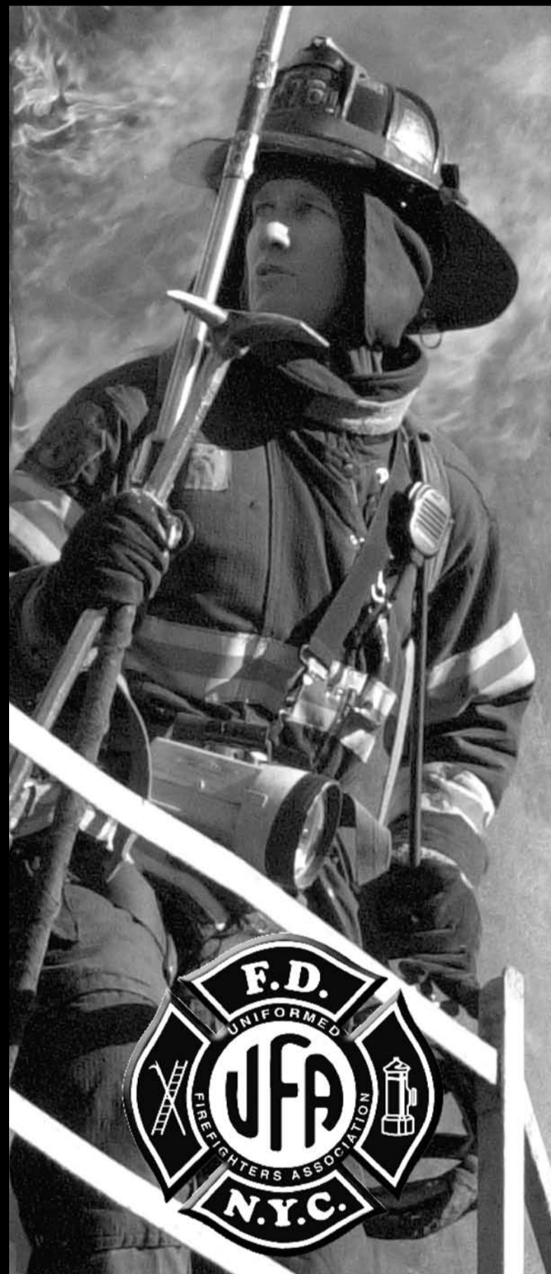
UNIFORMED FIREFIGHTERS ASSOCIATION